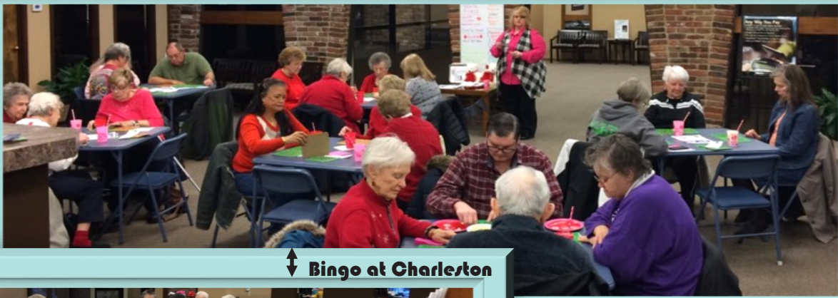
↑ ↓ Bingo at Charleston